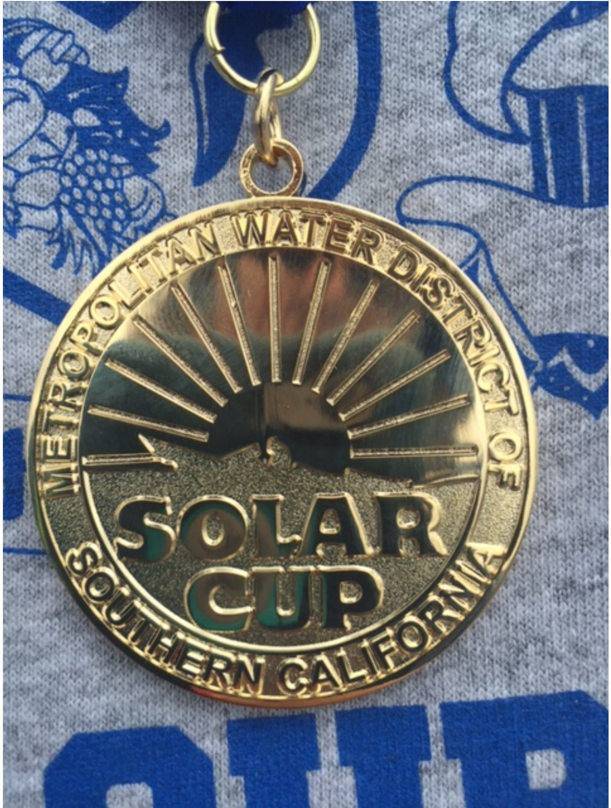
The 2016 Solar Cup medal.