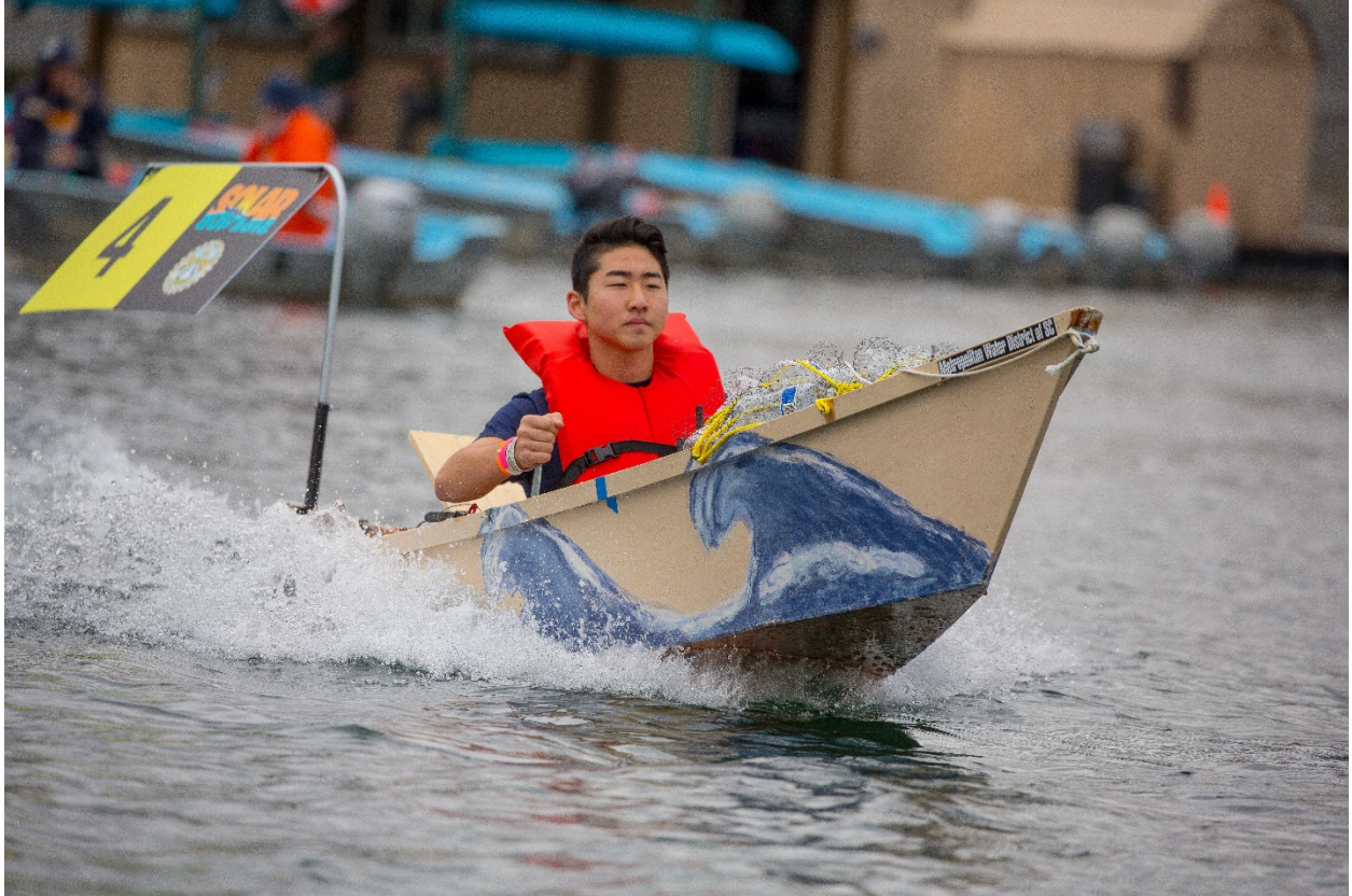
A Chino Hills High Solar Cup team member in the sprint race.