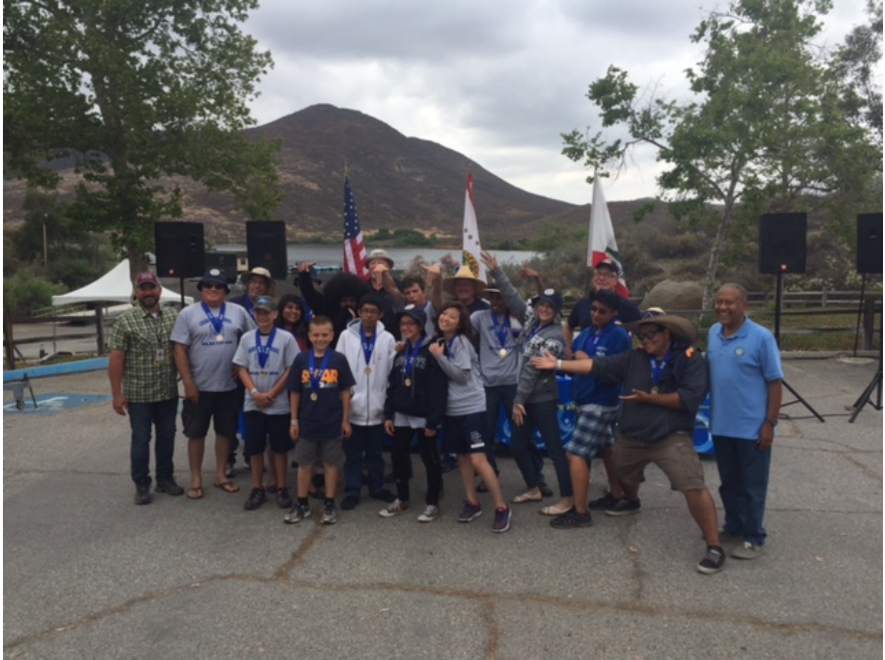
The Chino High Solar Cup team.