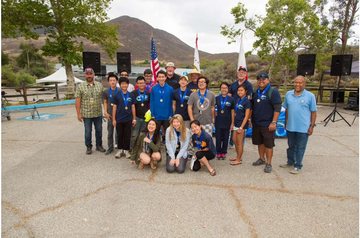
Chino Hills High's 2016 Solar Cup team.