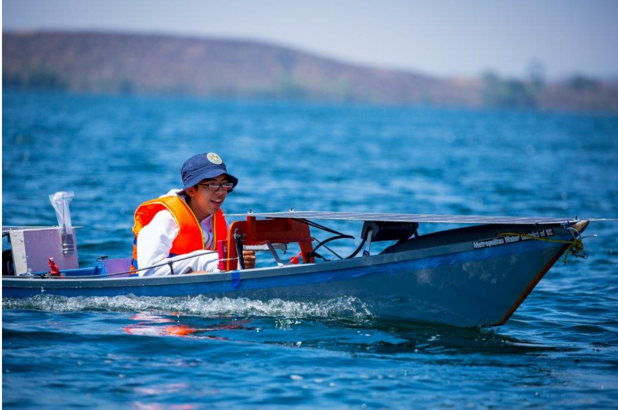
A member of the Chino High Solar Cup team participates in the endurance race on Lake Skinner near Temecula.