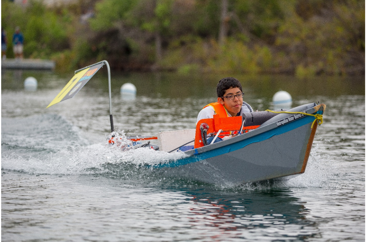
A Chino High Solar Cup team member takes to the water for the sprint race.