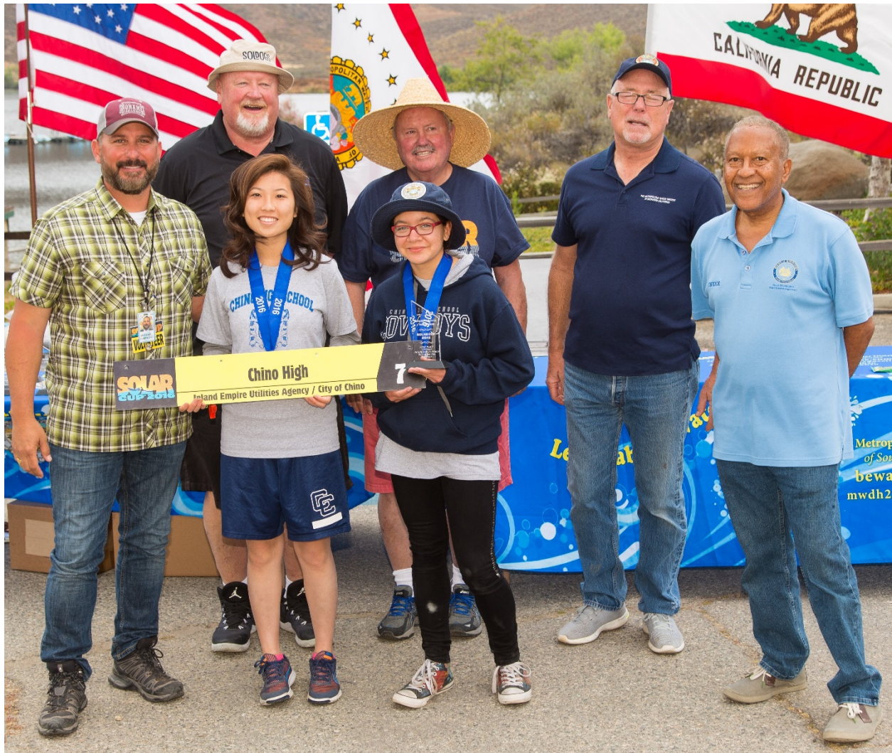
Members of the Chino High Solar Cup team accept its second place award.